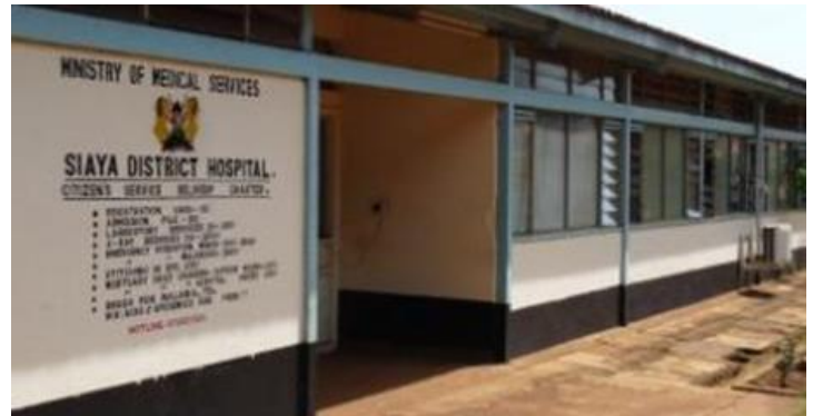
County plans to institutionalize the Action Tracker feature on the Scorecard Web Platform