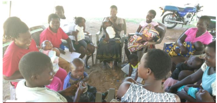
Teen Moms Club with older moms providing support

Prioritized services for pregnant teens following Scorecard-related bottleneck analysis (BNA) on persistently low ANC rates. A correlation was found between wards with low ANC and high teenage pregnancy. This triggered establishment of a Teenage Pregnancy Task Force chaired by the County Commissioner and setting up of a Teen Moms Club by a Member of the County Assembly (MCA).